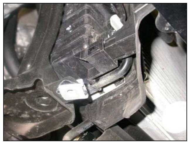
P-B-27.55/50 Figure 3 New Crimping Method